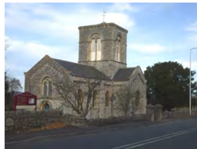
Holy Trinity - Cleeve