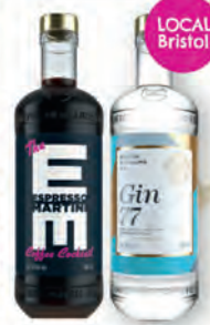
EM (70cl) RRP £20.50 Gin77 (70cl) RRP £23