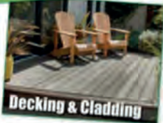
Decking & Cladding